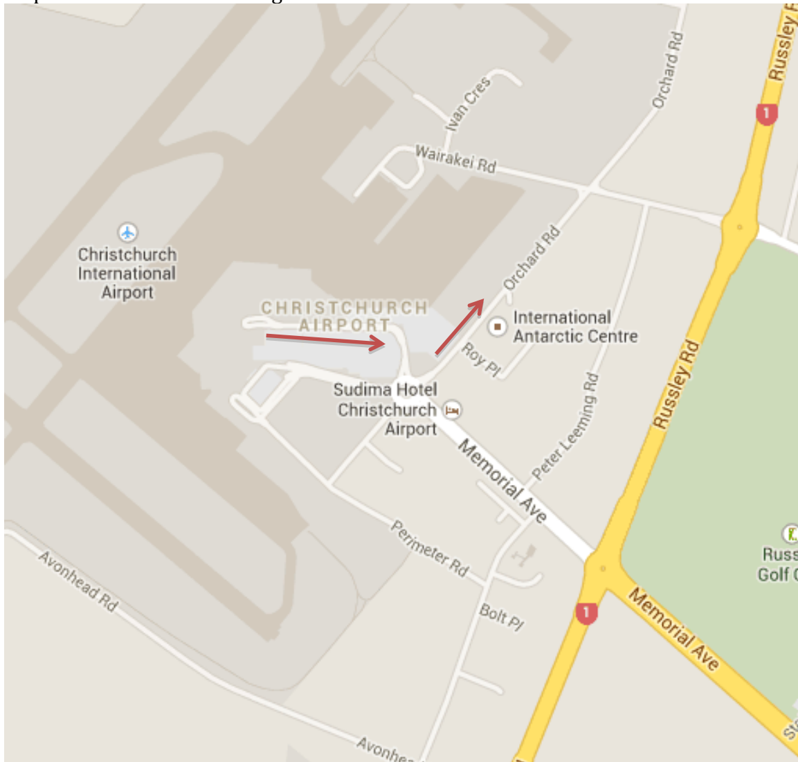
Figure 1. Local map for the vicinity of Christchurch International Airport and nearby Antarctic Center

The NSF Antarctic Center is located just north of the Christchurch International Airport on Orchard Road. The building address is 37 Orchard Road and is a long two story office building just north of the International Antarctic Center Museum and Visitor Center. A zoom in of the area immediately adjacent to the International Airport is shown below in Figure 1.