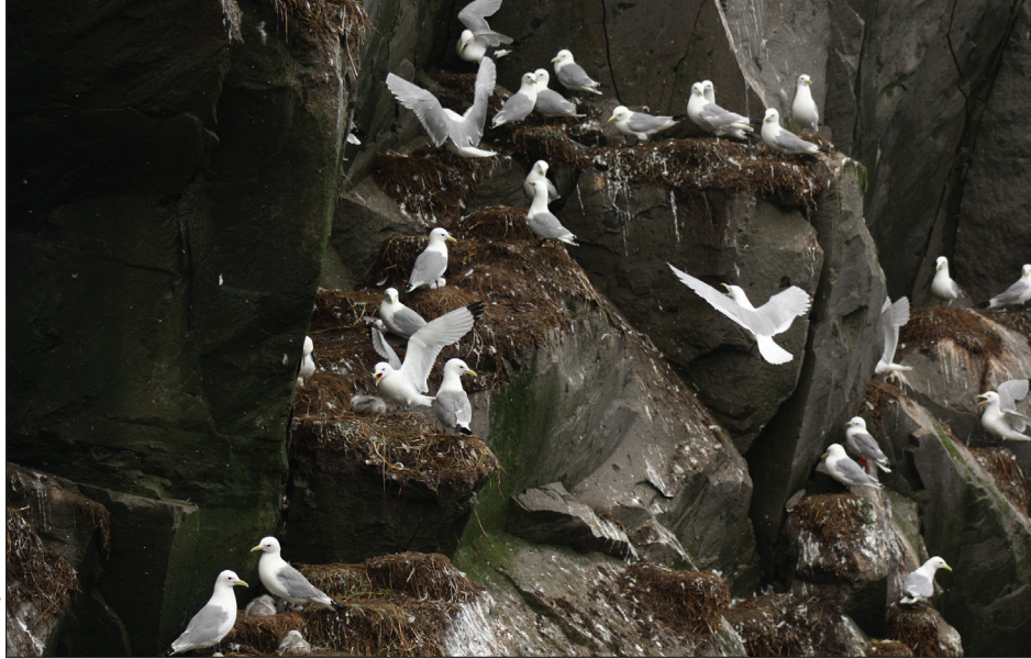
Black-legged kittiwakes nesting on St. Paul Island. Several chicks are visible in nests- including the small round chick at the feet of the adult bird at bottom left.