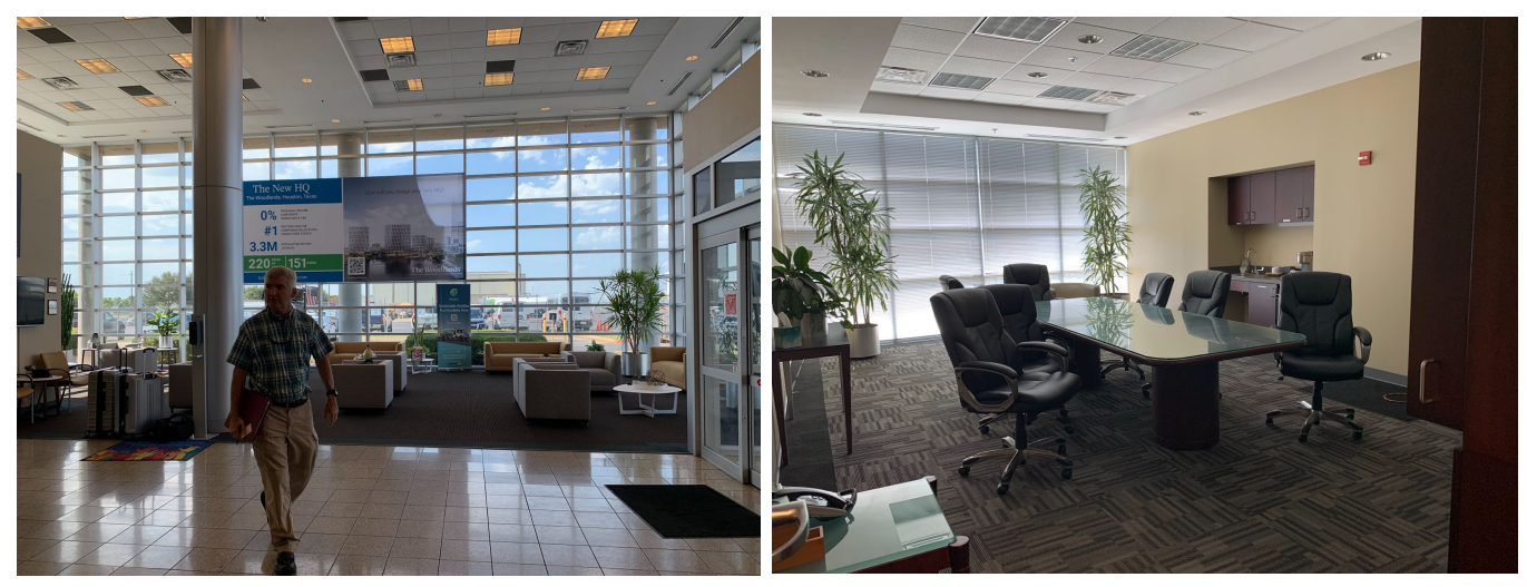
Figure 3. The Signature FBO. Left: Lobby seating area; Right: meeting room.