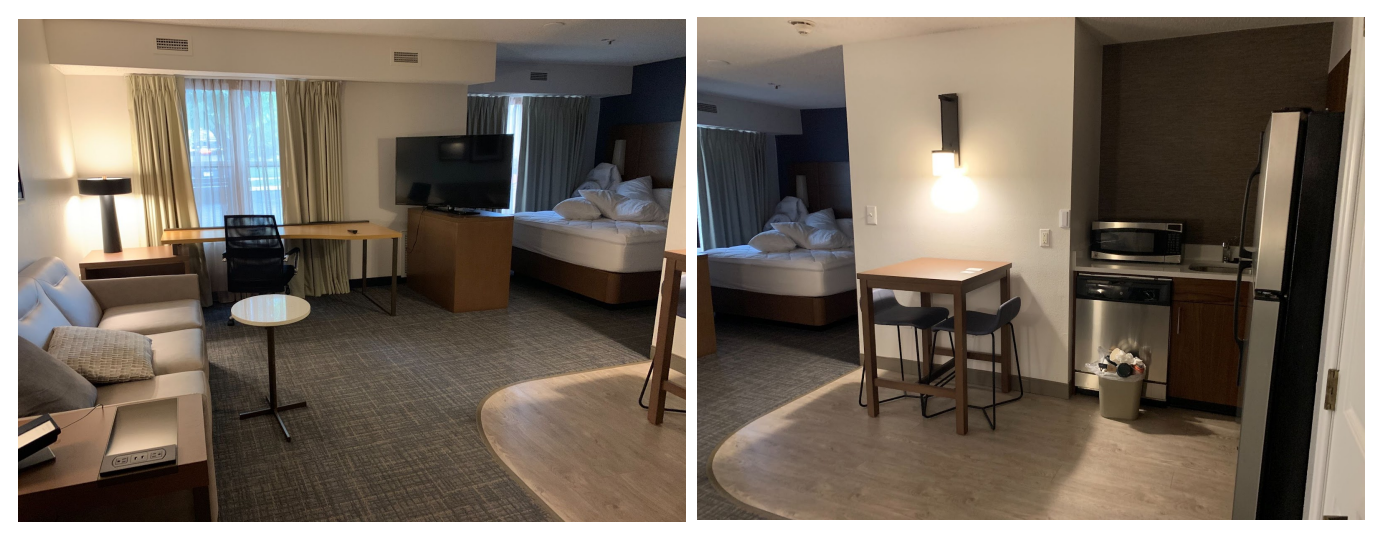
Figure 6. The Residence Inn Austin South standard guest room.

The Residence Inn Austin South will be the lodging location. Similar to all standard Residence Inn in other locations, the hotel offers a kitchenette, a dining table and a work desk in each room (Figure 6). The kitchenette also provides flatware, dinnerware, kitchen utensils, and a microwave. The hotel offers free continental breakfast in the morning and it has a swimming pool and small gym for the guests. (Figure 7). With the Austin City Limit Festival occurring around the same time, we have proceeded with reservation (for a total of 12 rooms) for the project period. Please make sure your travel plan is consistent with the <u>master schedule</u> by September 14th, 2022.