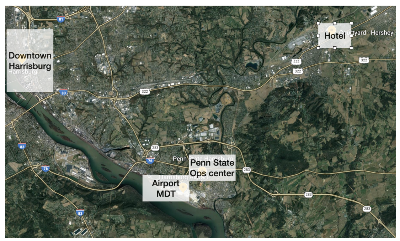
Figure 9. An overview of the operation locations in Harrisburg, PA.

An overview of the Harrisburg area and MAIR-E operation locations are shown in Figure 9. The airport is southeast from downtown Harrisburg, approximately 20 minutes by car. The operation center will be located on campus in Penn State University Harrisburg. The campus is within 10 minutes from the airport.