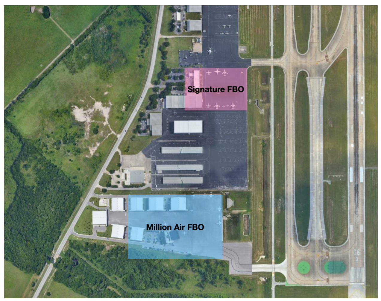
Figure 2. Austin FBO locations.