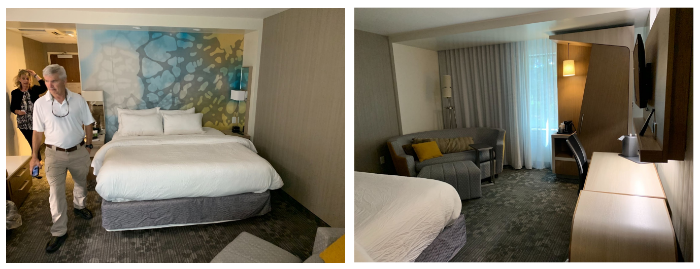
Figure 12. Courtyard standard guest room.