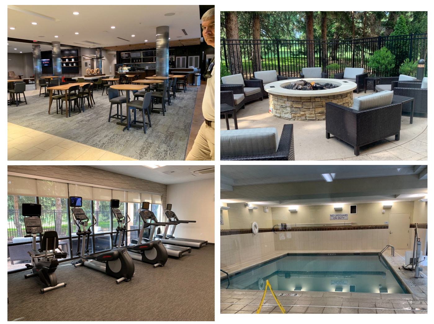
Figure 11. Courtyard Hershey Chocolate Ave amenities.