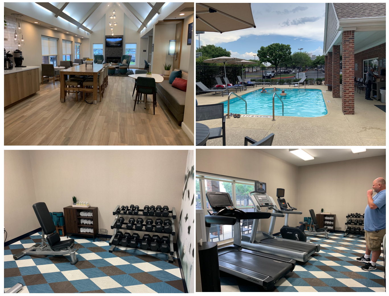
Figure 7. The Residence Inn Austin South. (a) the breakfast lobby; (b) the swimming pool; (c,d) the gym.