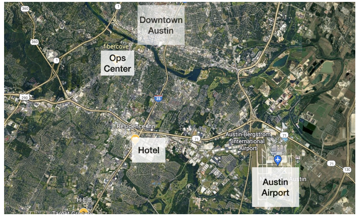
Figure 1. An overview of the operation locations in Austin, TX

An overview of the Austin area and MAIR-E operation locations are shown in the image below (Figure1). With the airport located in the southeast, our locations are chosen in the southern part of the city to avoid major highway traffic. The airport can be reached from the hotel via local roads in approximately 15 minutes. The operation center will be in the coworking place, Fibercove. The Fibercove will be approximately 20~25 minutes from the airport and about 15 minutes from the hotel. Amenities such as grocery stores (H.E.B.) and restaurants are less than 10 minutes away south from the hotel.