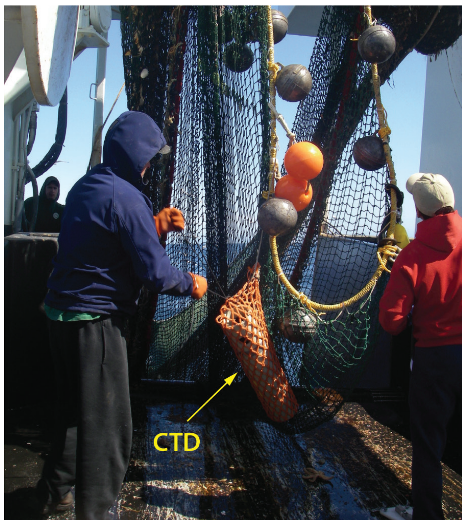
A ruggedized CTD being attached to the bottom trawl net on the NOAA contract survey vessel F/V Arcturus.