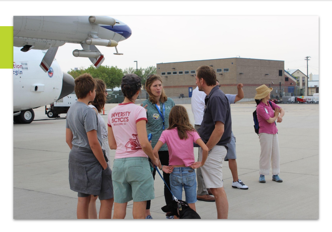
The WE-CAN PI engages with the public during an open house of the NSF/NCAR C-130 aircraft.