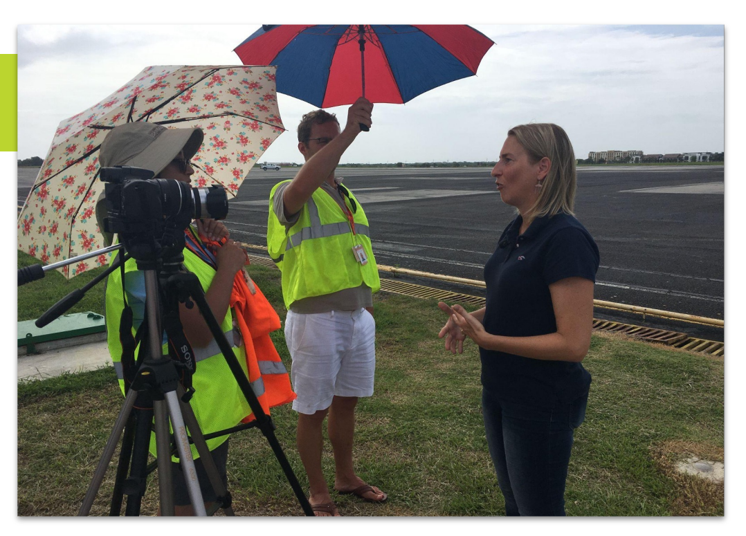
The PI of the OTREC field campaign is interviewed for a video series about the field campaign.