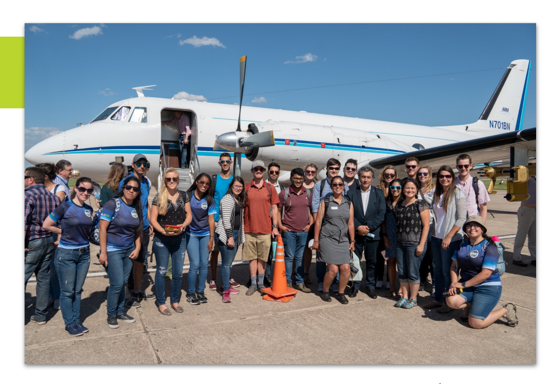
Working with students in the field is very rewarding. During RELÁMPAGO, a graduate student cohort was involved in a 3-week Advanced Studies Institute.