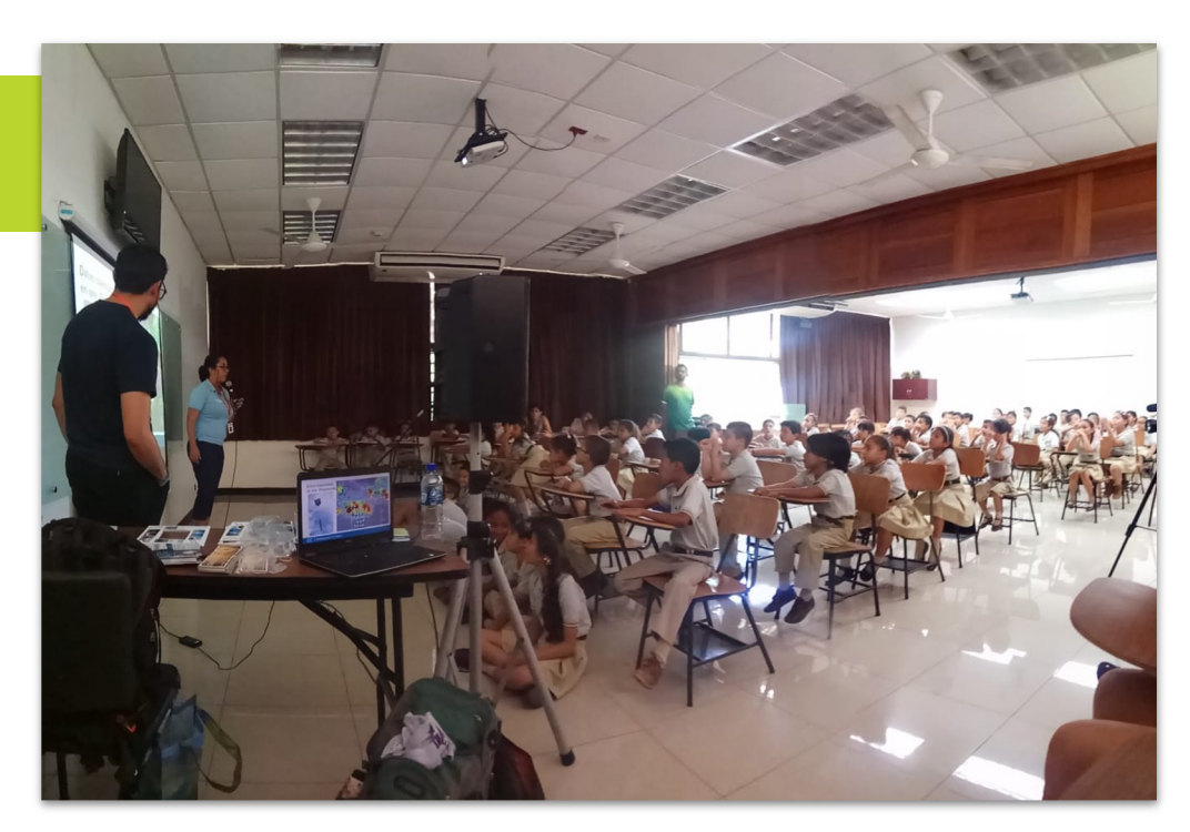
During OTREC, one of the radiosonde sites was at an elementary school, so we regularly engaged the students.