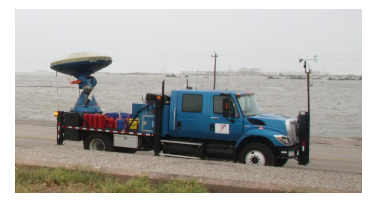
Figure 1. DOW-6.

DOW-6 (Figure 1) arrived on campus Sunday November 9 and the training for DOW operations commenced on November 10. The training was administered by Justin Walker, CSWR Technician. All 14 students in Radar Meteorology, the PI of UNDEO (A. Houston), and 3 graduate students with prior radar meteorology coursework were trained. The training covered basic DOW operation including powering up the