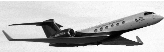
HAIPER Craft On Maiden Assignment

The National Science Foundation’s (NSF) new HAIPER (high-performance instrumented airborne platform for environmental research) aircraft is taking high-altitude, precision atmospheric readings.