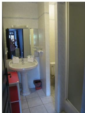
Apartment to share