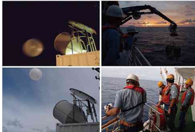
Figure 3. R/V Mirai operations during the leg CINDY/DYNAMO deployment in the Indian Ocean.

R/V Mirai cruise leg 2 began on 28 October after from Colombo, Sri Lanka and all measurements as described on the catalog and in the CINDY reports were resumed. The Mirai was on station at the Equator when the MJO active phase occurred in late November over the Indian Ocean.