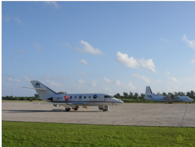
Figure 6. CNES Falcon 20 jet aircraft on the tarmac at Gan International Airport, Maldives

The French SAFIRE Falcon 20 jet aircraft was deployed to Gan Island to make microphysical measurements in the anvils of convective systems within the coverage area of the S-Polka and SMART-R radars. The aircraft was in the Maldives from late November through mid-December 2011 and 8 research and or calibration missions were flown. These measurements will be part of the calibration of a new satellite recently launched as a collaboration between France and India.