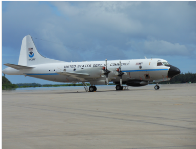
Figure 5. NOAA P-3 on the tarmac at Diego Garcia during DYNAMO.

The French SAFIRE Falcon 20 jet aircraft was deployed to Gan Island to make microphysical measurements in the anvils of convective systems within the coverage area of the S-Polka and SMART-R radars. The aircraft was in the Maldives from late November through mid-December 2011 and 8 research and or calibration missions were flown. These measurements will be part of the calibration of a new satellite recently launched as a collaboration between France and India.