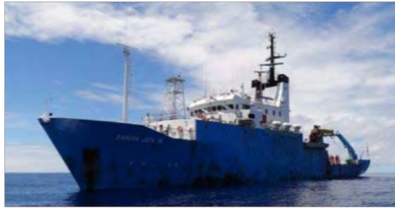
Figure 2. Indonesian R/V Baruna Jaya III as deployed during CINDY/DYNAMO in the Indian Ocean.

R/V Mirai cruise leg 2 began on 28 October after from Colombo, Sri Lanka and all measurements as described on the catalog and in the CINDY reports were resumed. The Mirai was on station at the Equator when the MJO active phase occurred in late November over the Indian Ocean.